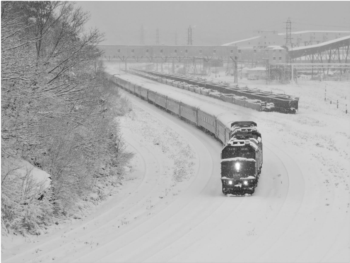
Photo – B&W - Prototype - 2nd