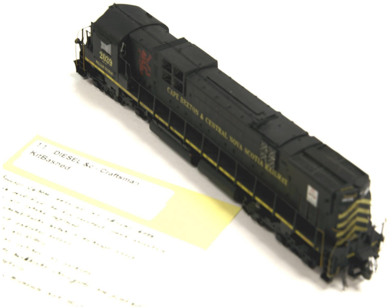
Craftsman Class - 1 st Diesel &c – Will Lawrence