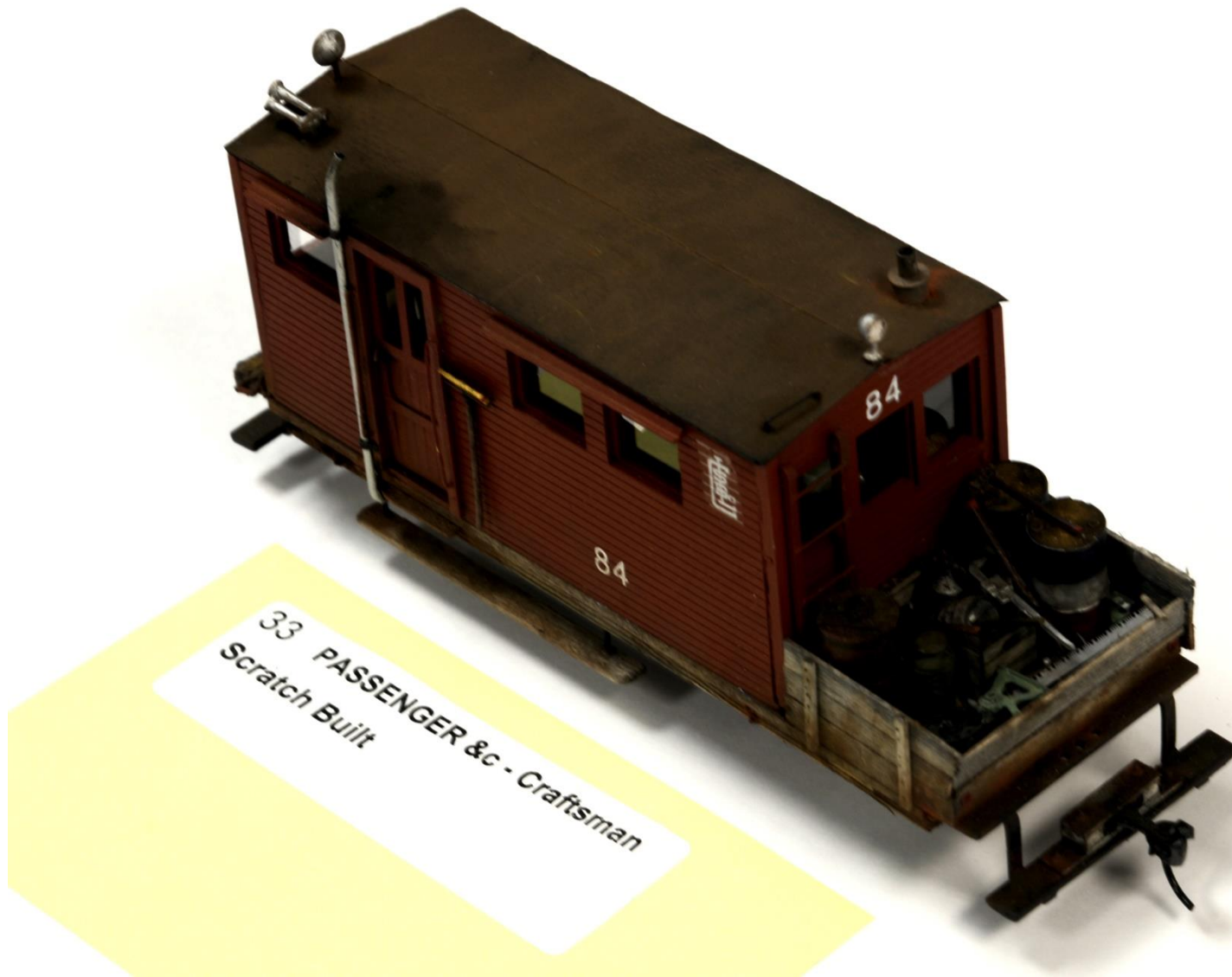
Craftsman Class - 1 st Passenger – Pete Mesheau