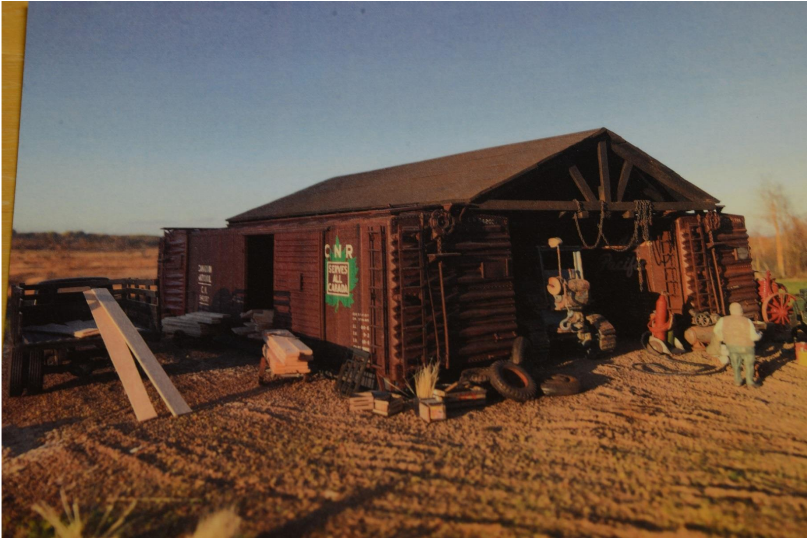
Best In Show