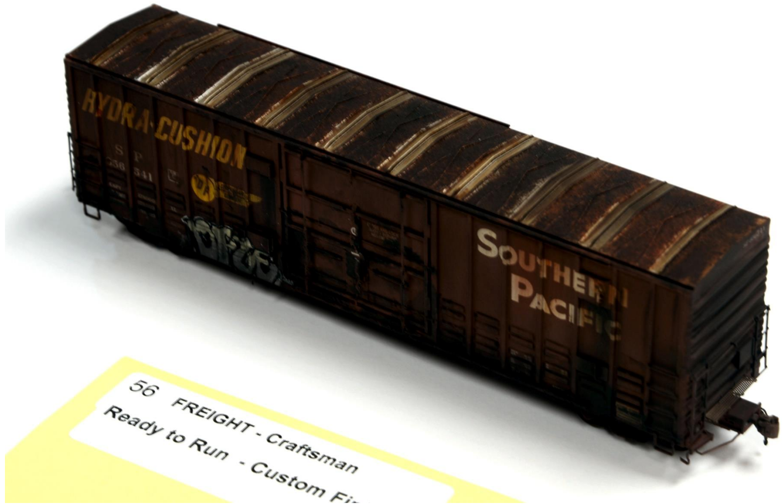
Craftsman Class - 3 rd Freight - Tim Hayman