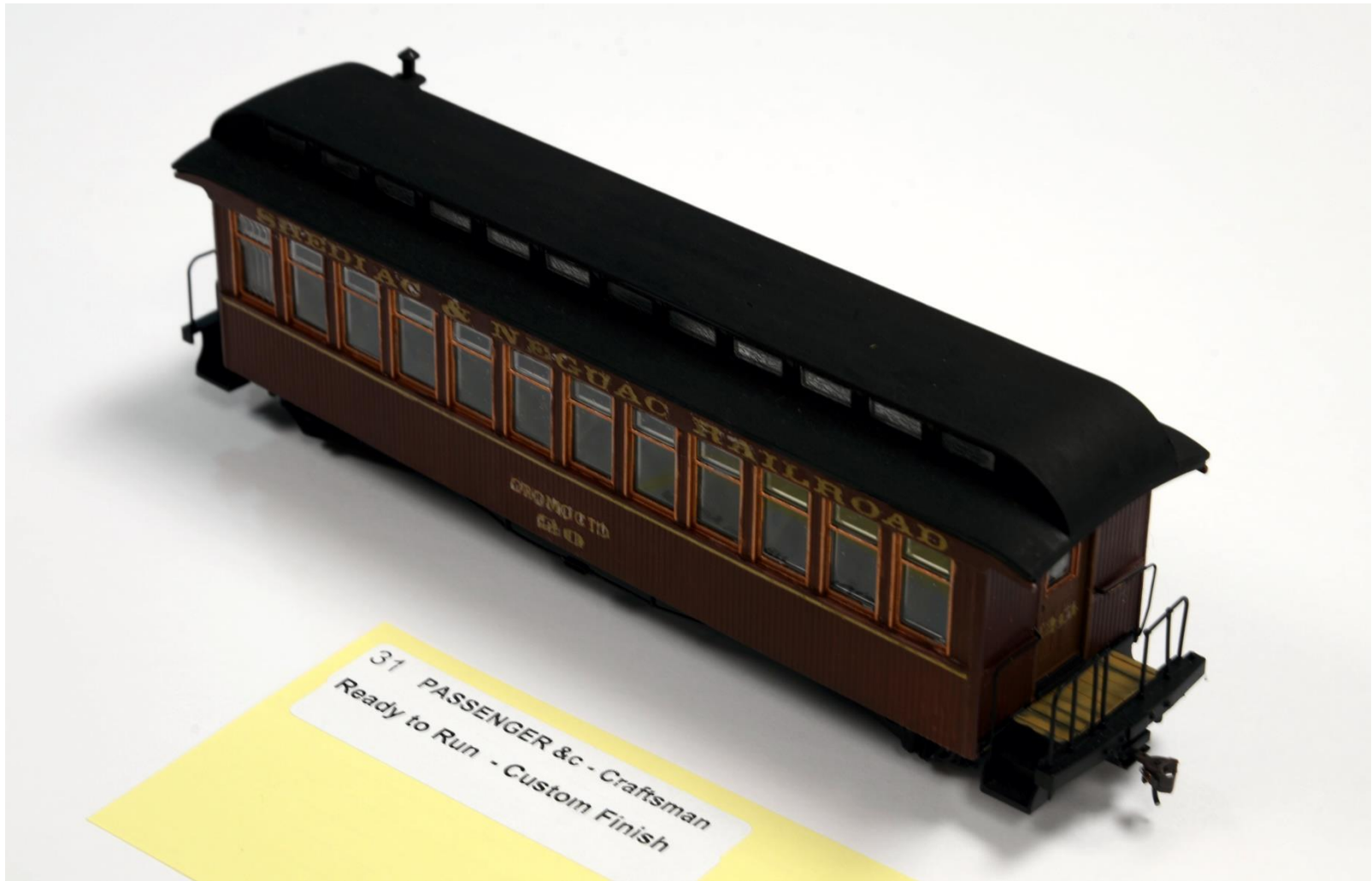
Craftsman Class - 2 nd Passenger – Pierre Lanctot