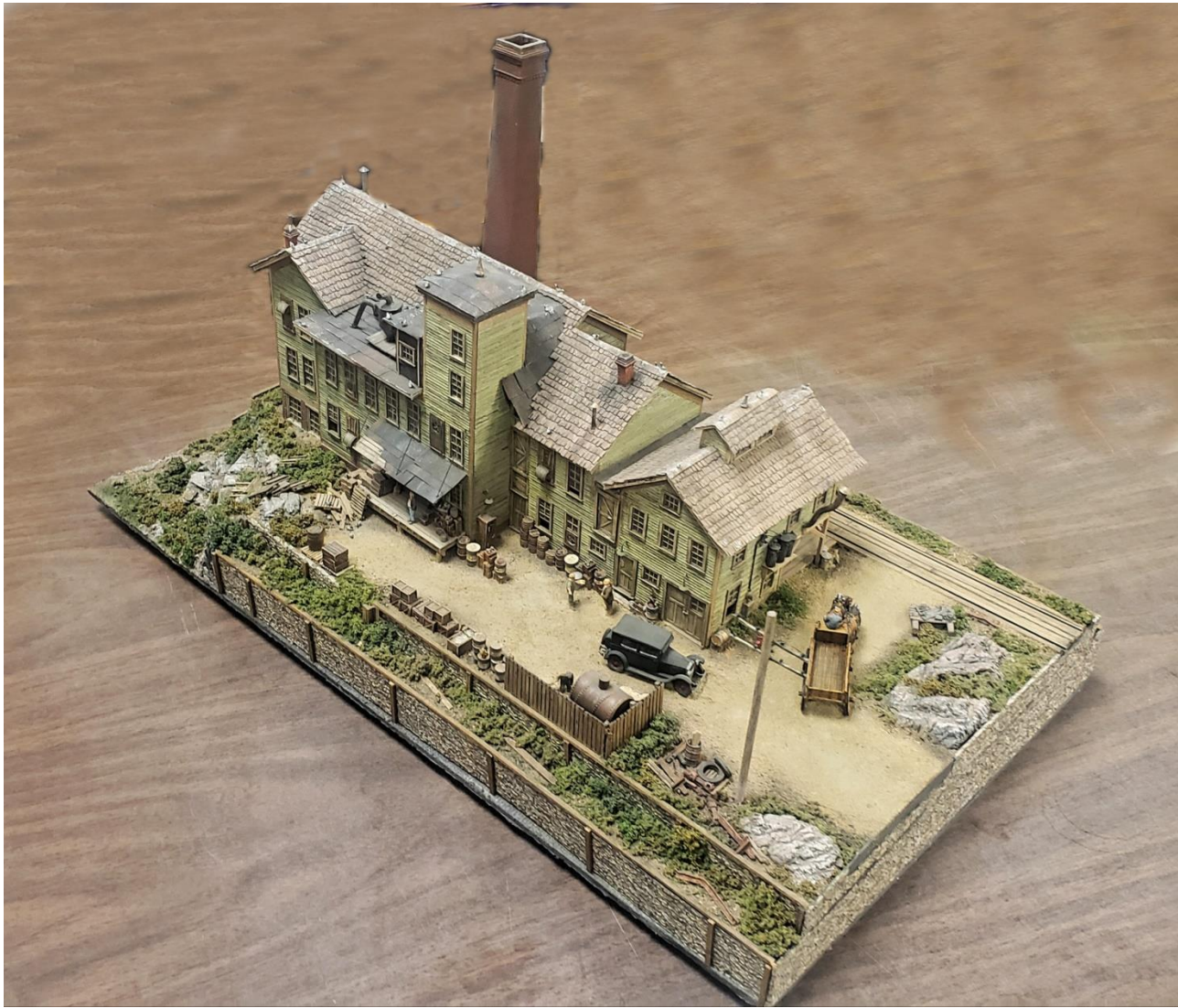
Best In Show – Model - Chris Lyon