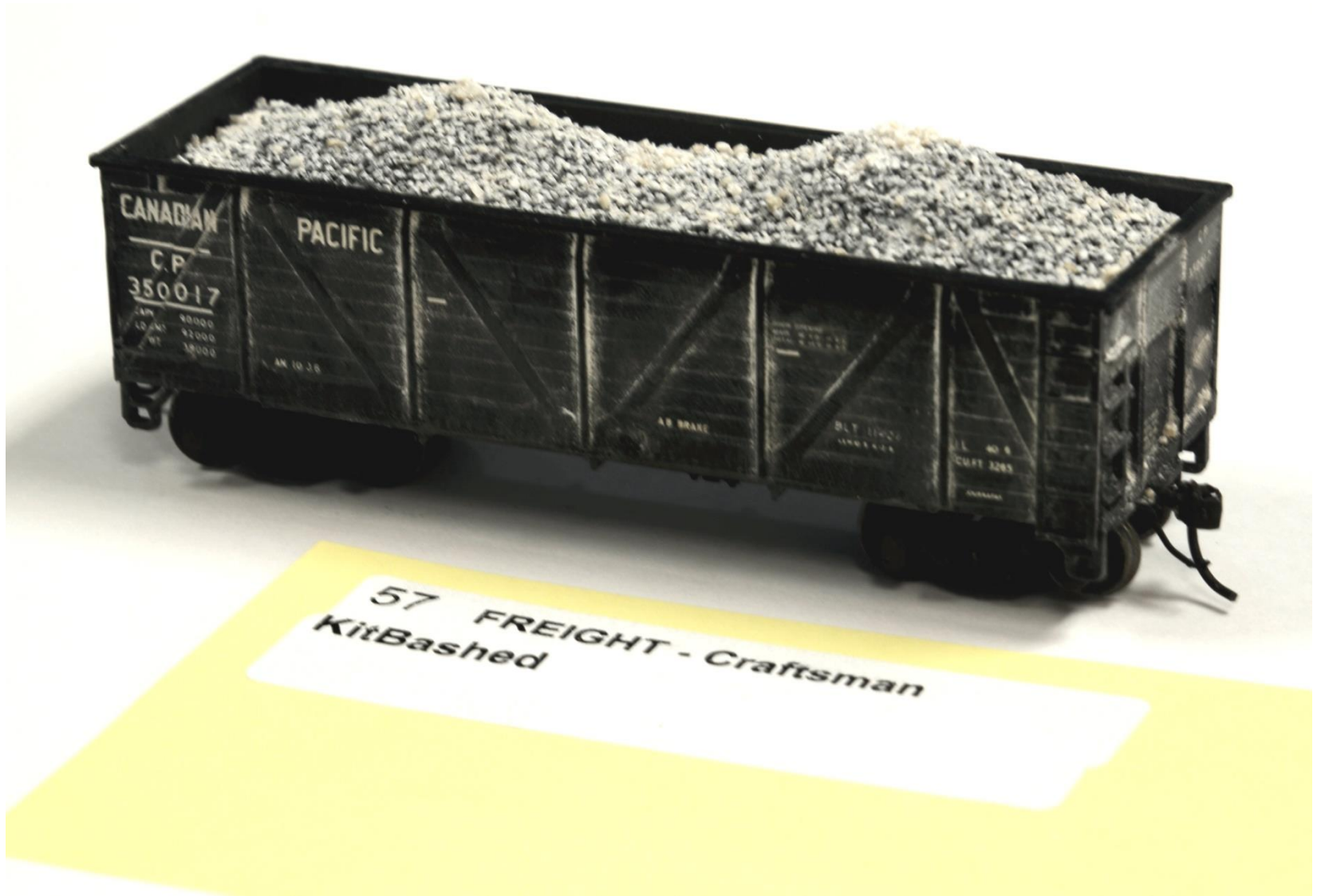
Craftsman Class - 2 nd Freight - Dan Conlin