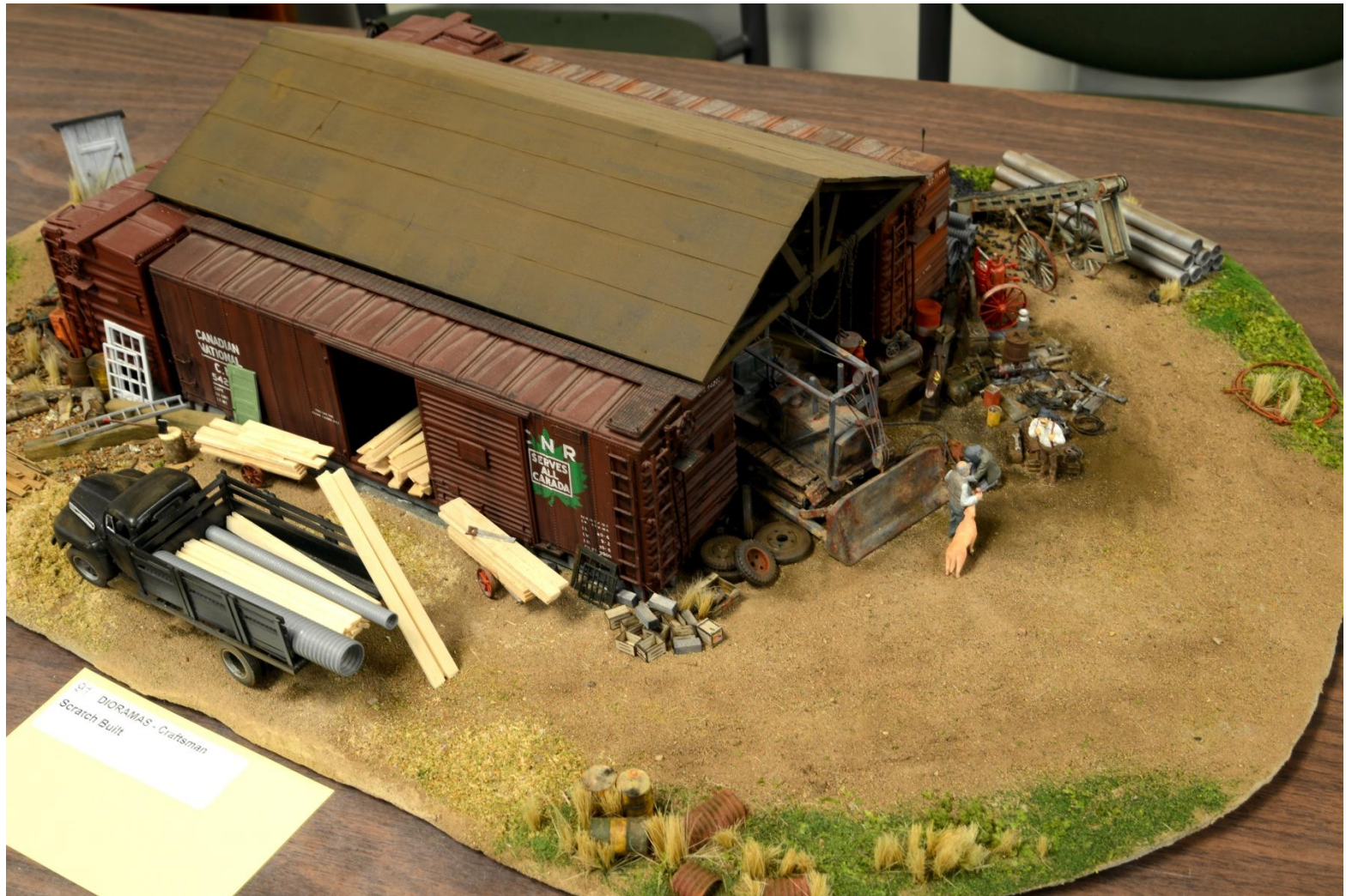
Craftsman Class - 1 st Dioramas – Pete Mesheau