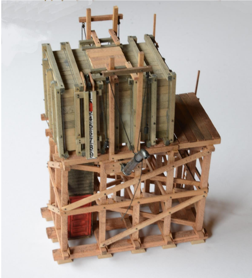
Craftsman Class - 1 st Structures - Pierre Lanctot