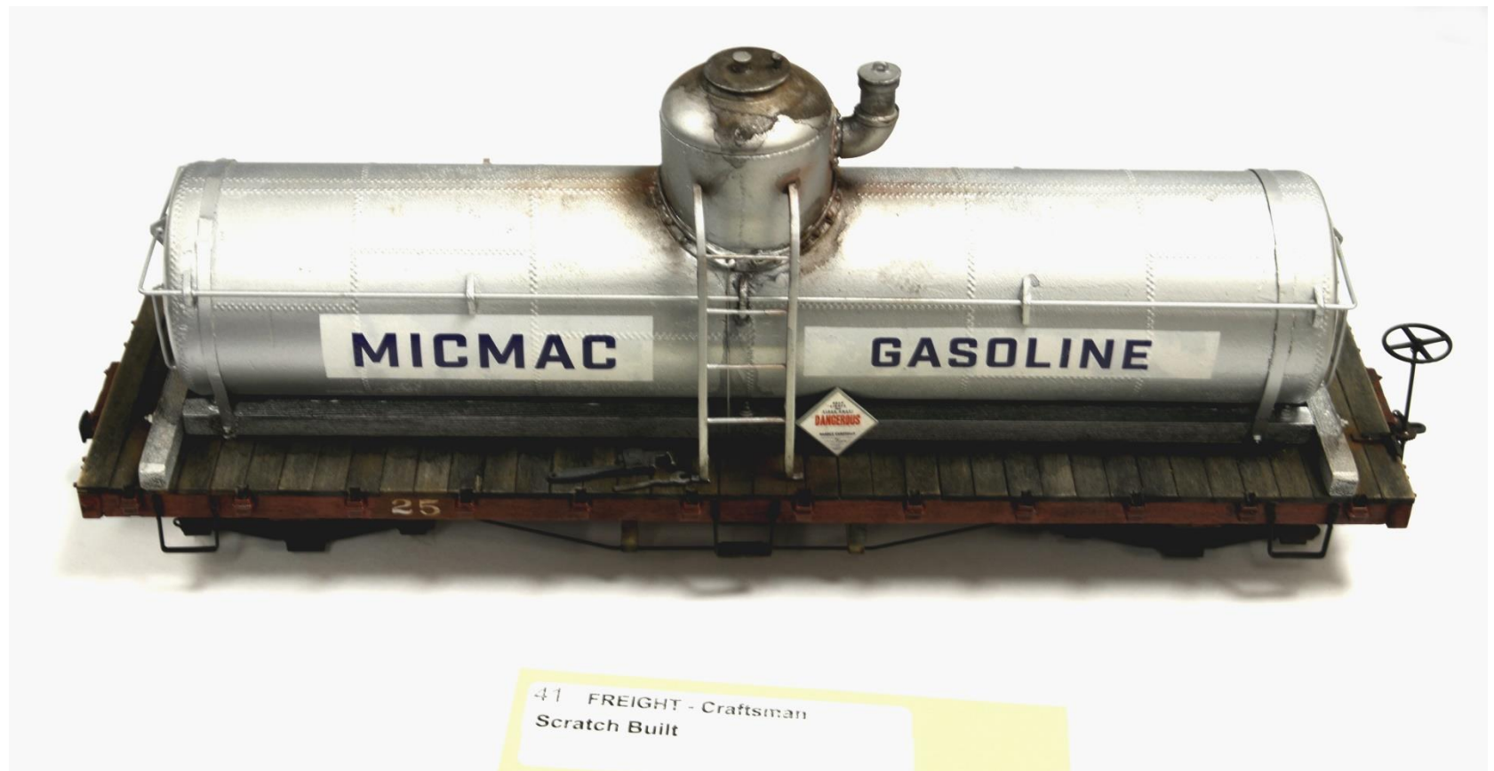
Craftsman Class - 1 st Freight – Pete Mesheau