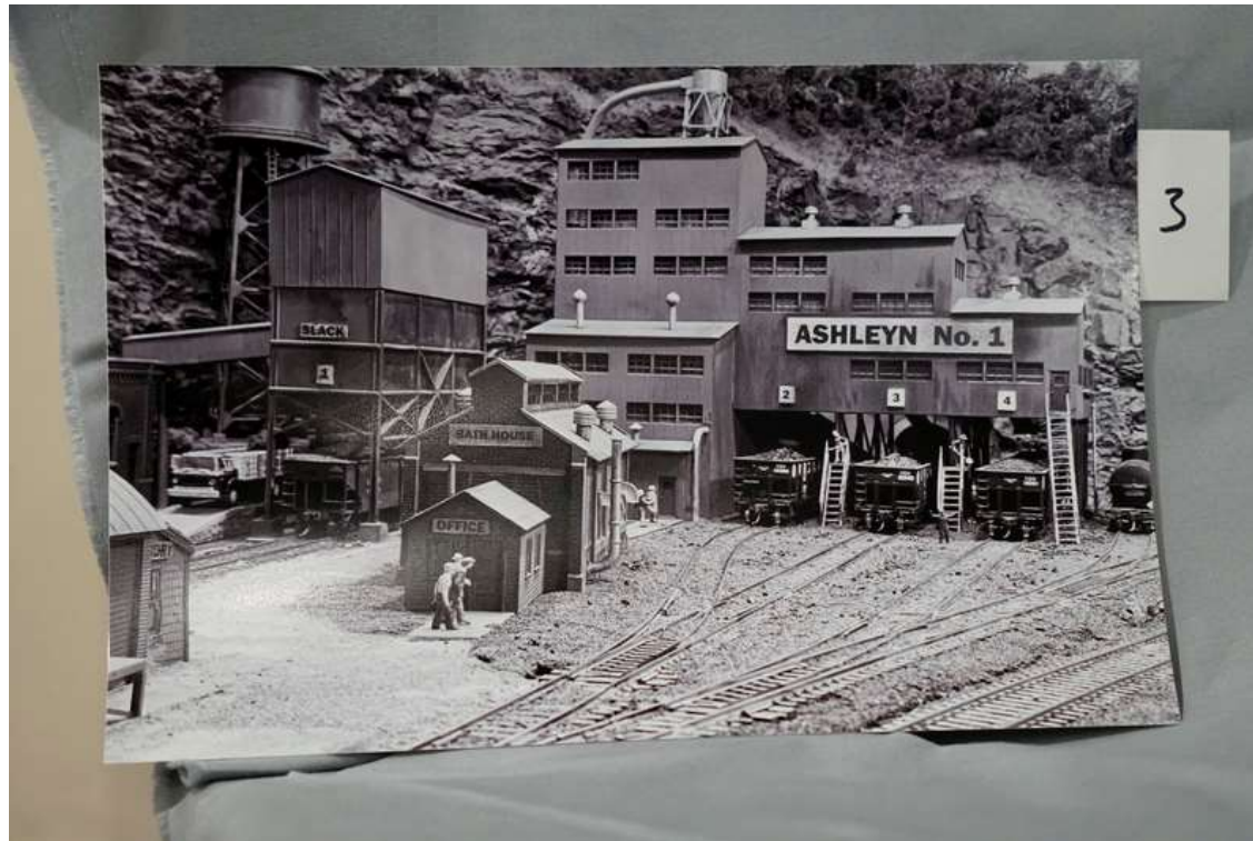
Tory Eisenhauer – Ashley No.1 Coal Mine