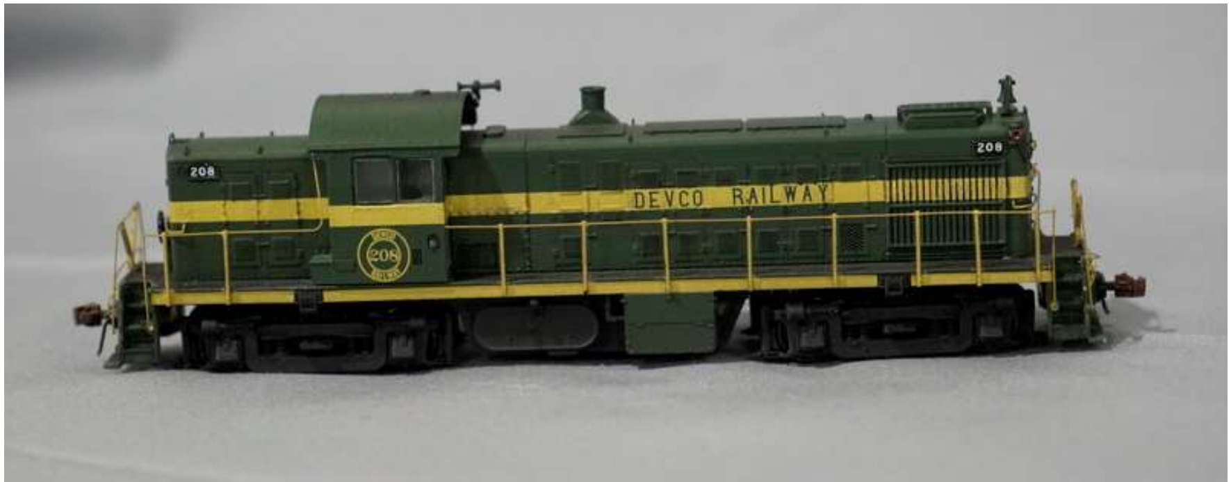
Will Lawrence – DEVCO RS-1 #208