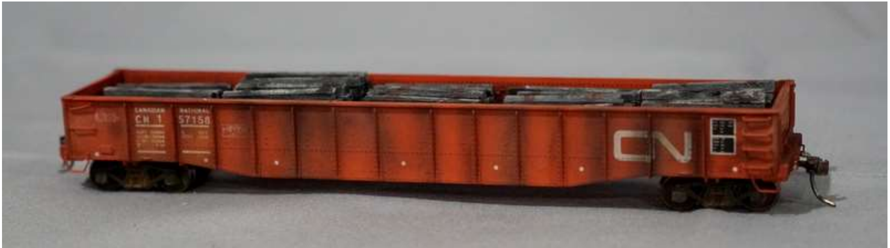
Brent Norton - CN Gondola – “Old Ties”