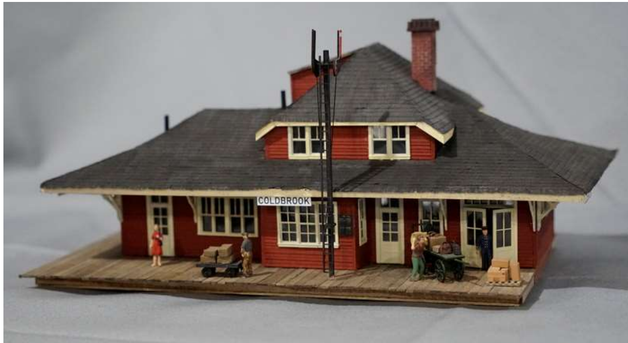
Louis McIntyre – Coldbrook Station