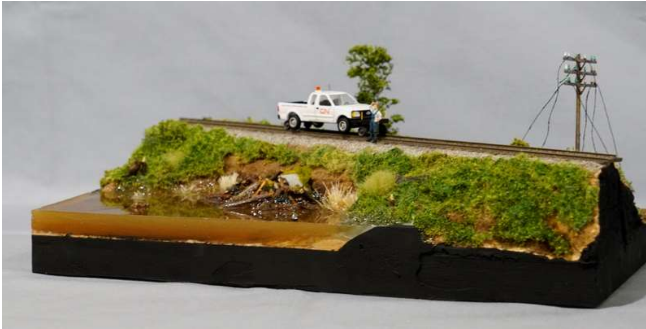
Tim Hayman – “Dam Beavers” Flooding threatens rural line.