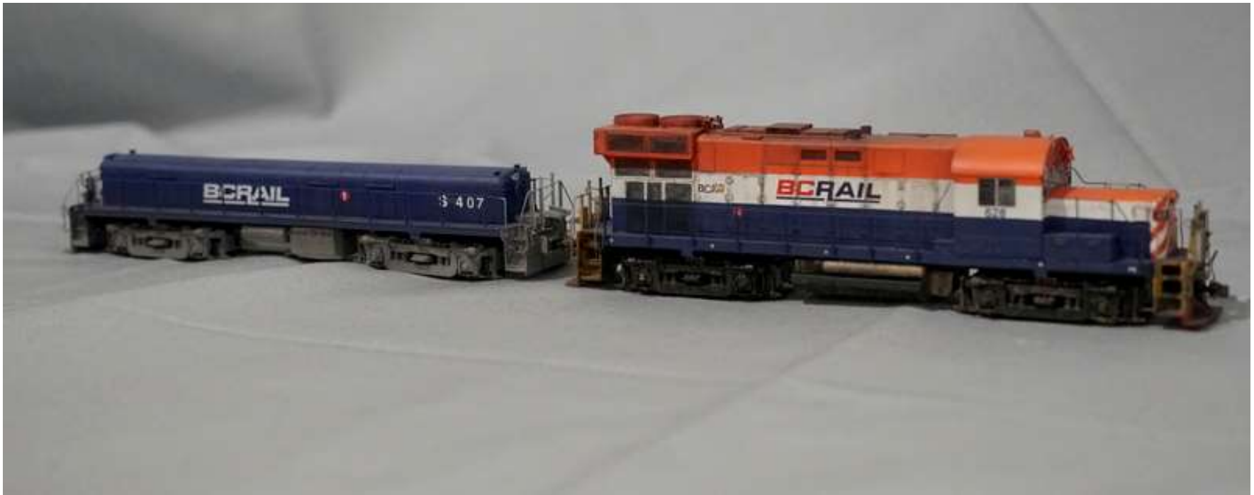
Luc Nowlan – BC Rail CRS-20