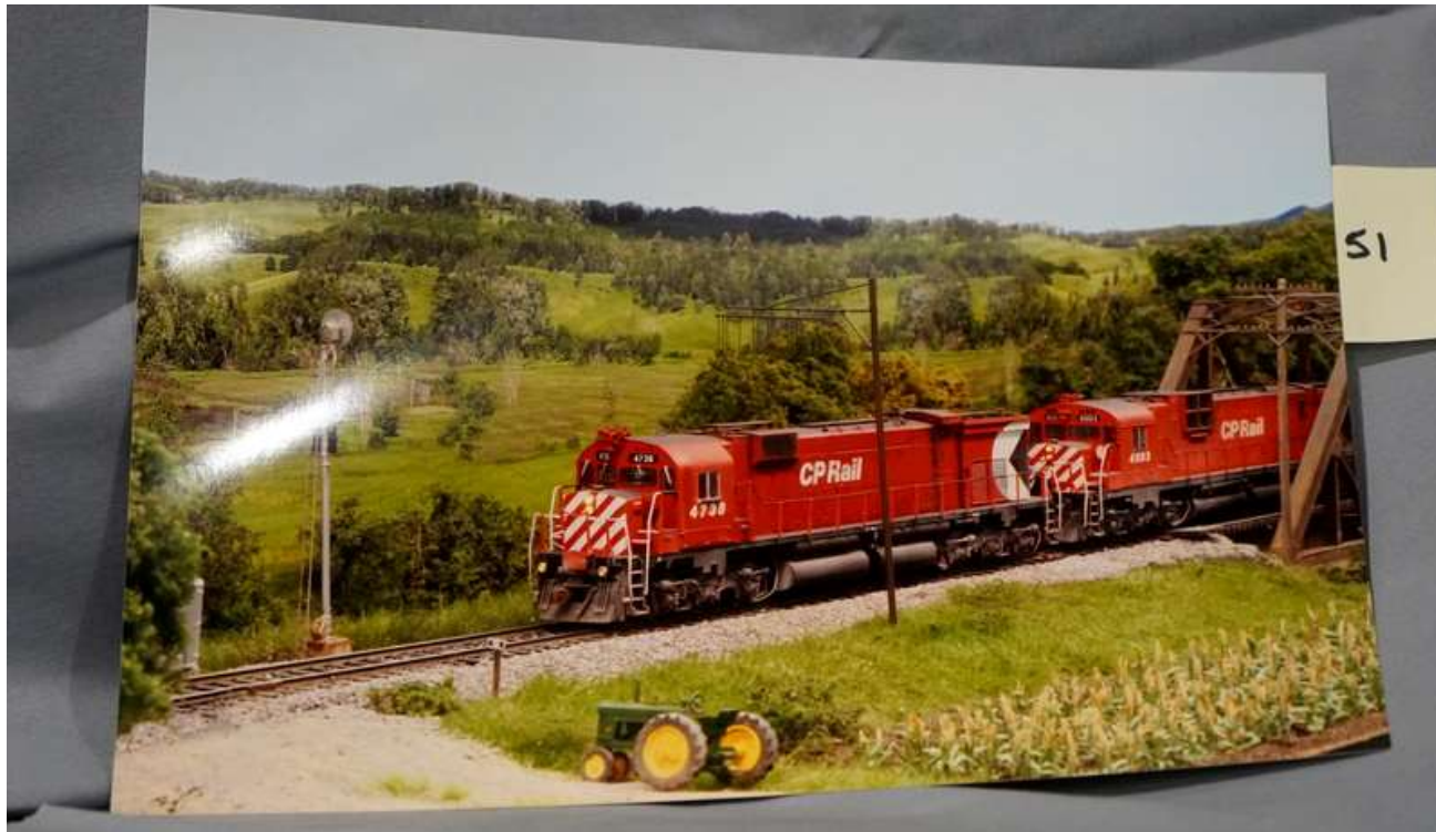
Luc Nowlan – CP Extra in Vermont