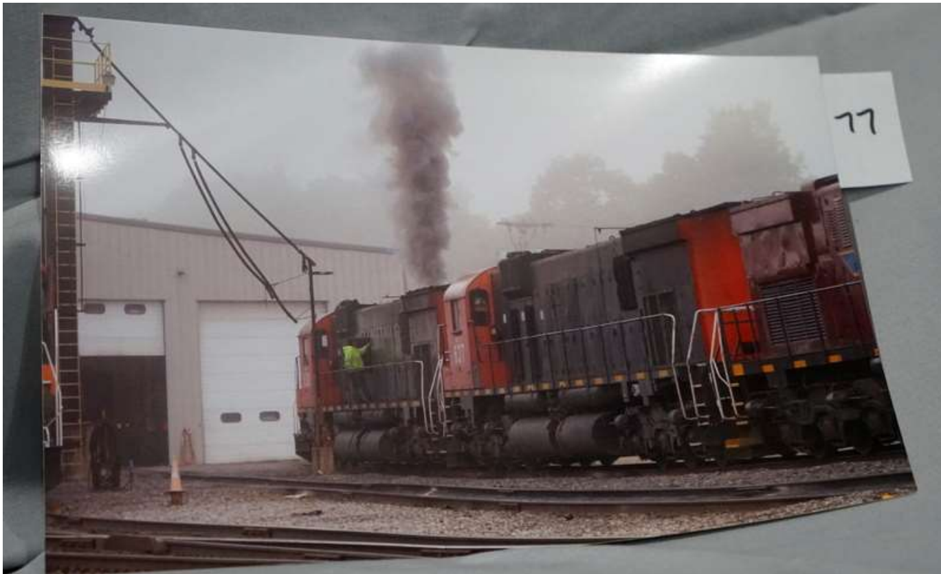
Luc Nowlan – Morning Start up in Oleans NY