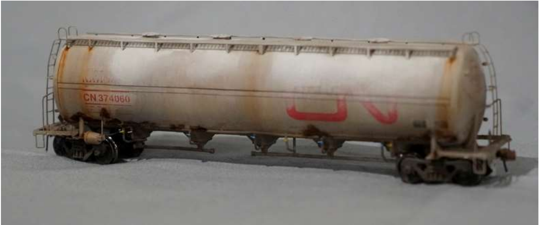
Tim Hayman - CN Pressure Flow Hopper