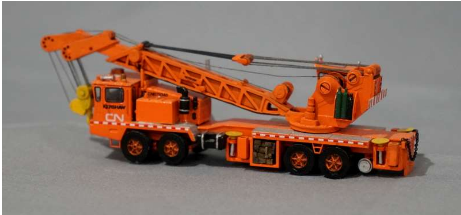
Taylor Main – Kershaw 130 Ton Crane