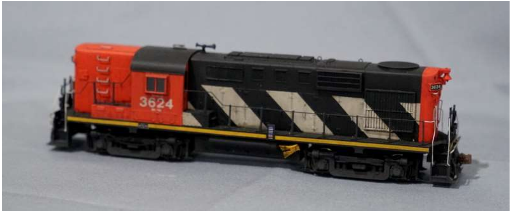
Taylor Main – CN RS 18 #3624