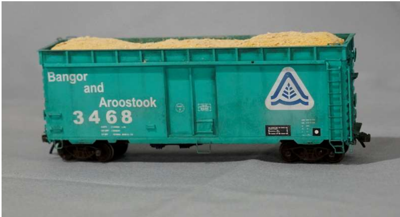
Bruce Castle – BAR Wood Chip Car