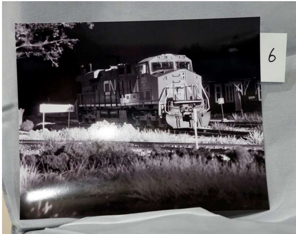
Tim Hayman – CN 2251 Basking in the morning sun