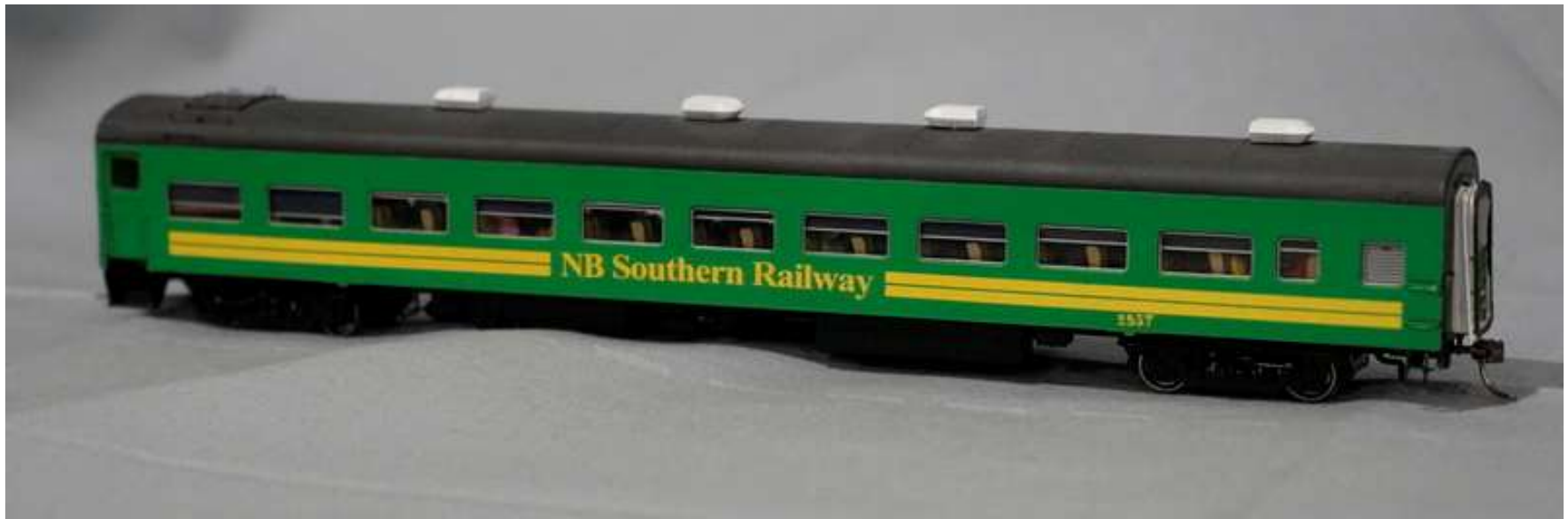
Gerald McCoy – NB Southern Railway Car