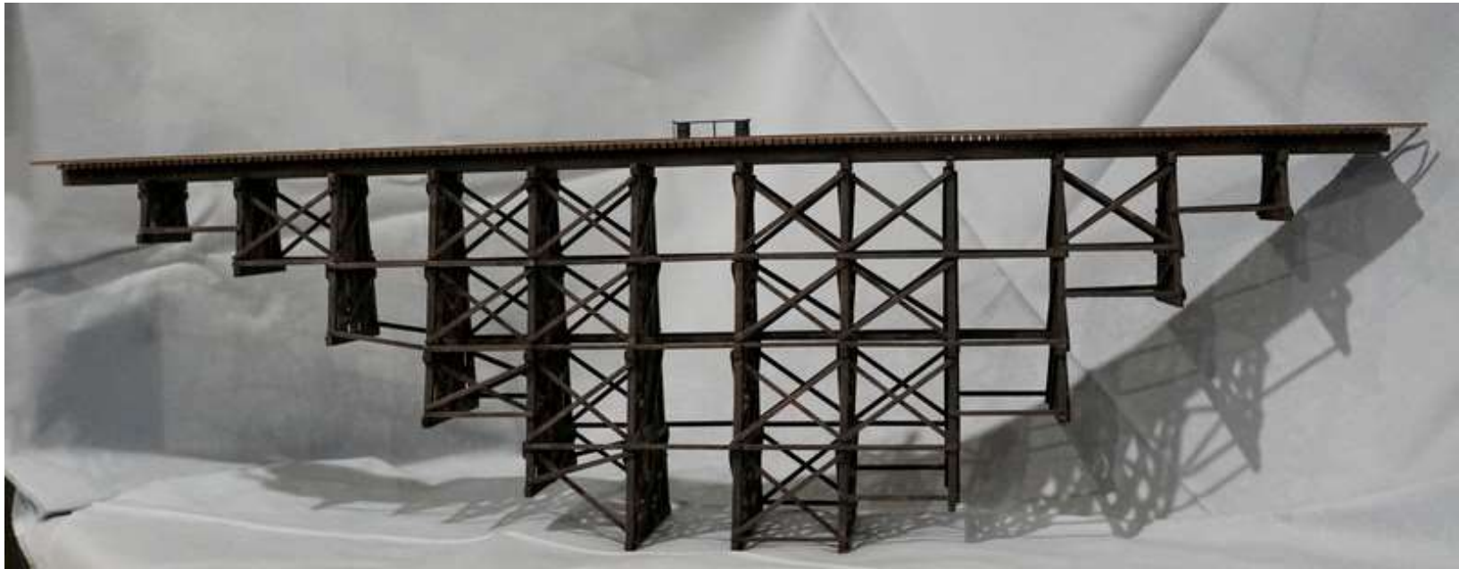
Taylor Main – Black Cape Trestle